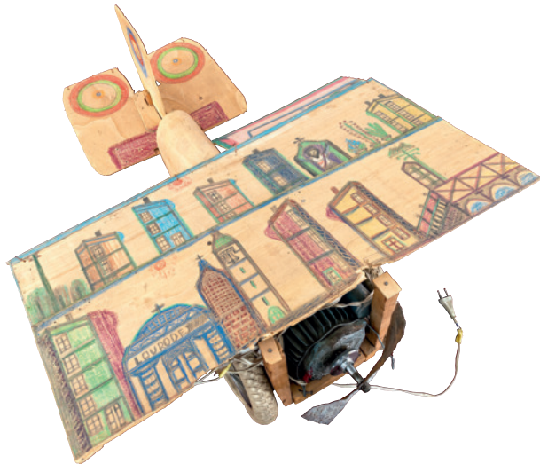
Costante Pezzani Motorflugzeug / Aeroplane

The museum warmly welcomes visitors. If you want to support the museum furthermore, you might like to join the Friends Of The Museum Haus Cajeth