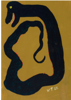
Pellegrino Vignali Die schwarze Schlange / The Black Snake