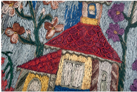
Elisabeta Ștefăniță Geneveva von Brabant (Ausschnitt) / Geneveva of Brabant (detail)